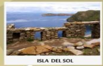
ISLA DEL SOL