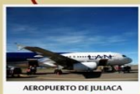
AEROPUERTO DE JULIACA