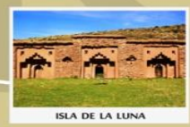
ISLA DE LA LUNA