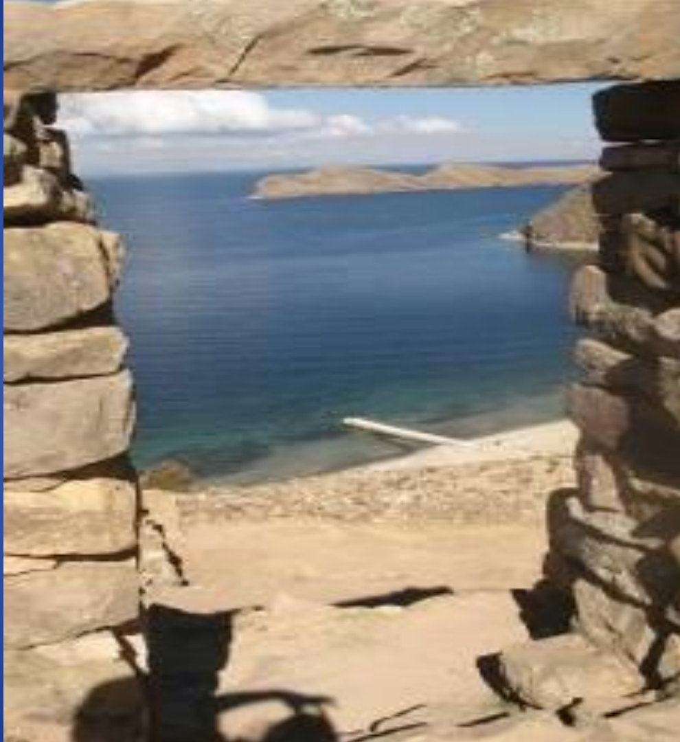
Chinkanas, Sacred place for ceremony